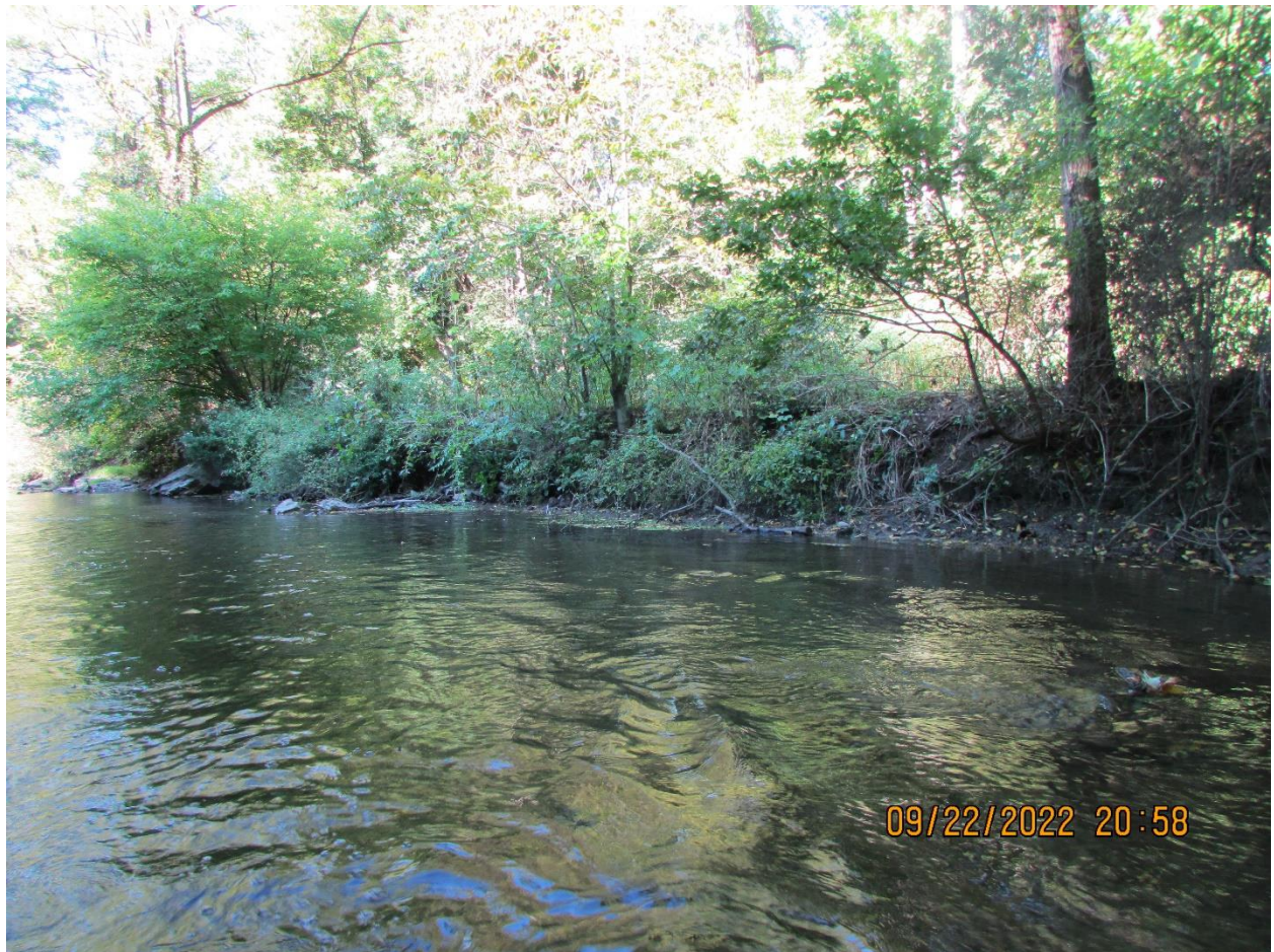
Picture showing steep, eroding bank in the Quittapahilla Creek downstream from Spruce Street