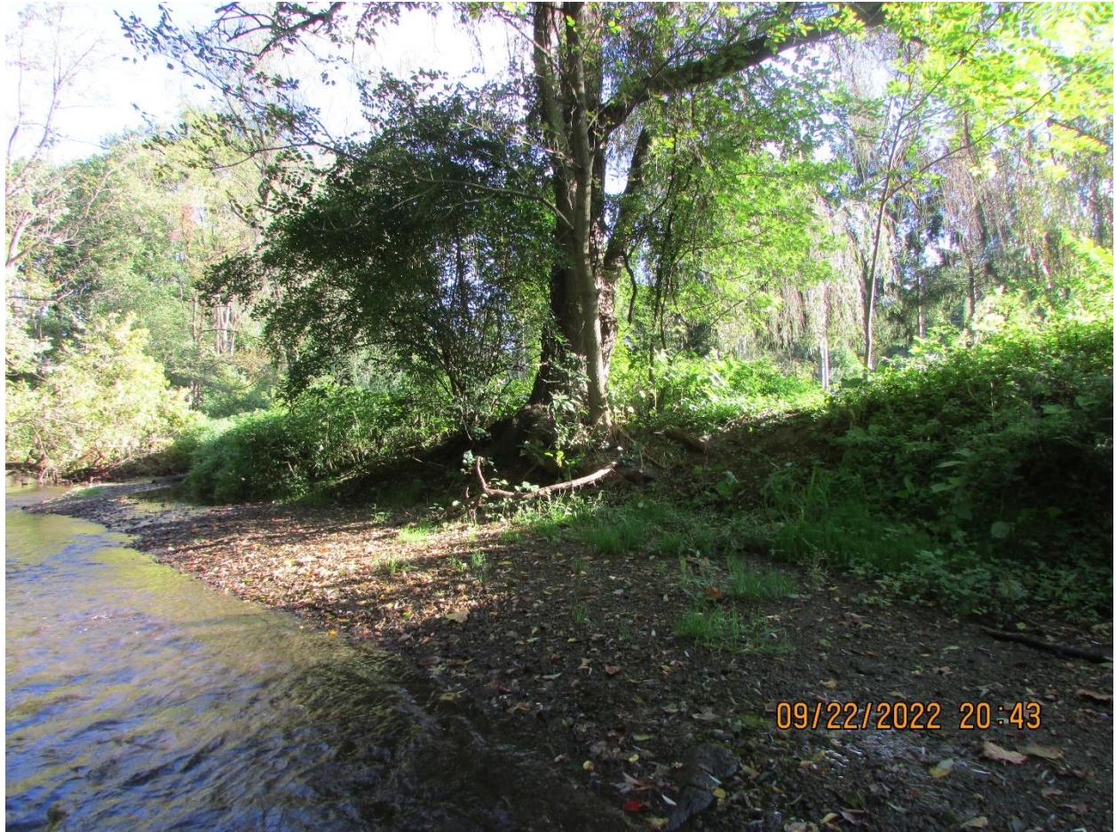
Picture showing extended gravel bar in Quittapahilla Creek, downstream from Spruce Street