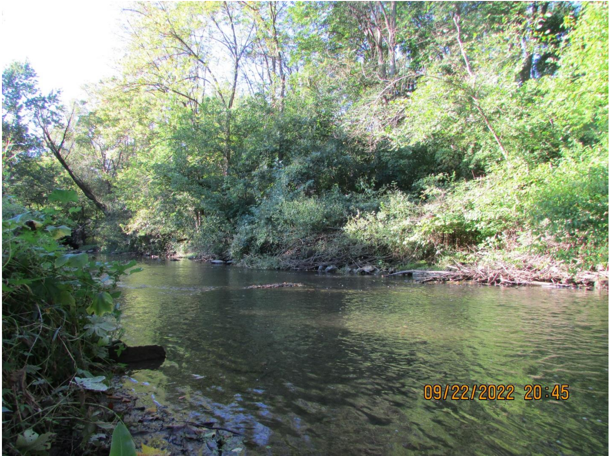
Picture showing shallow, poor habitat section of Quittapahilla Creek downstream from Spruce Street