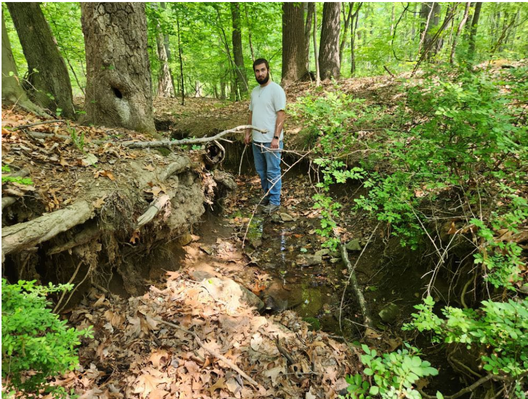
Photo 9 - Landowner standing in incised channel with severely undercut and eroding banks