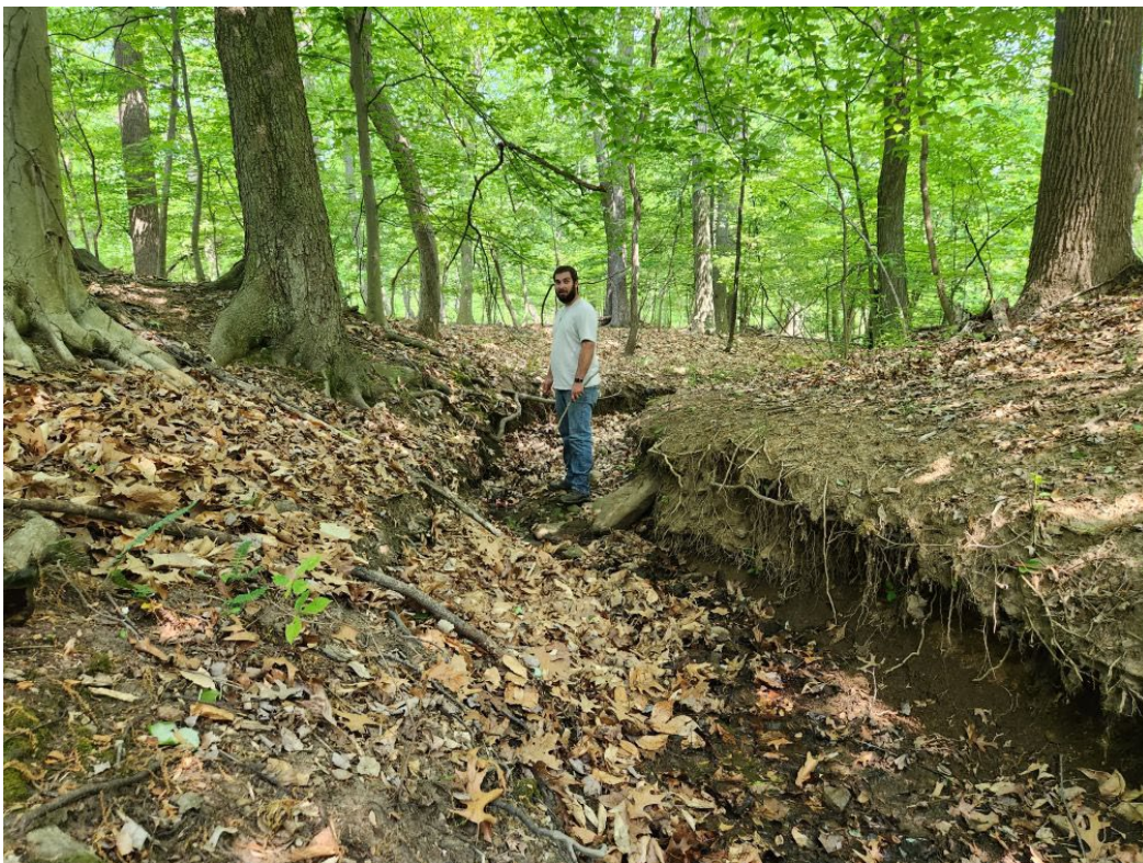
Photo 10 - Landowner standing in incised channel with severely undercut and eroding banks