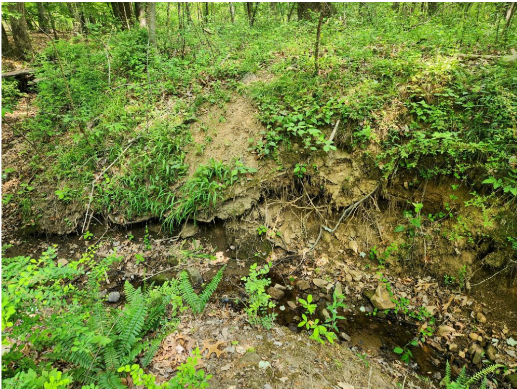
Photo 6 - Deeply incised channel with undercut and eroding banks