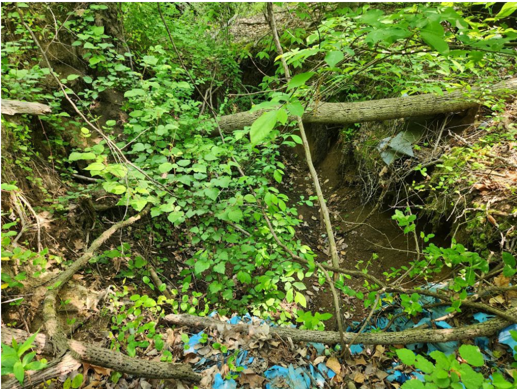
Photo 2 – Deeply incised channel with fallen tree, junk and debris