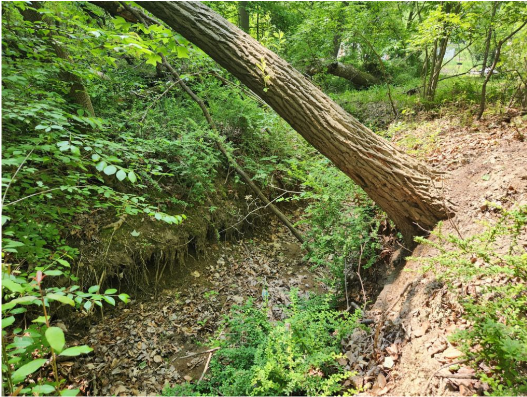
Photo 5 - Deeply incised channel with undercut and leaning tree