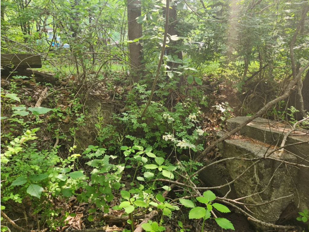
Photo 1 - Remnants of concrete dam