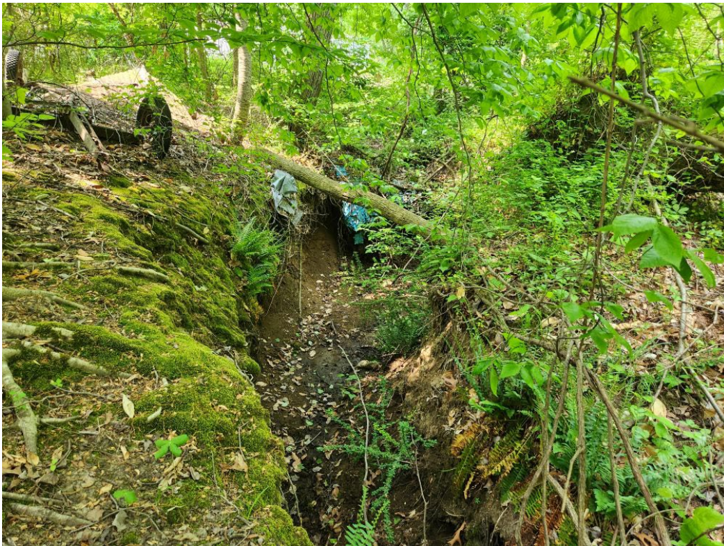
Photo 3 – Deeply incised channel with fallen tree, junk and debris