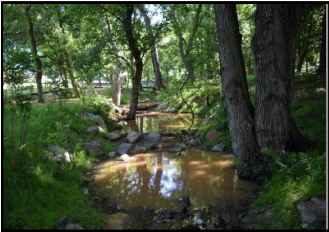
Photo 13 -- Example of Constructed Timber Boulder Step Pools