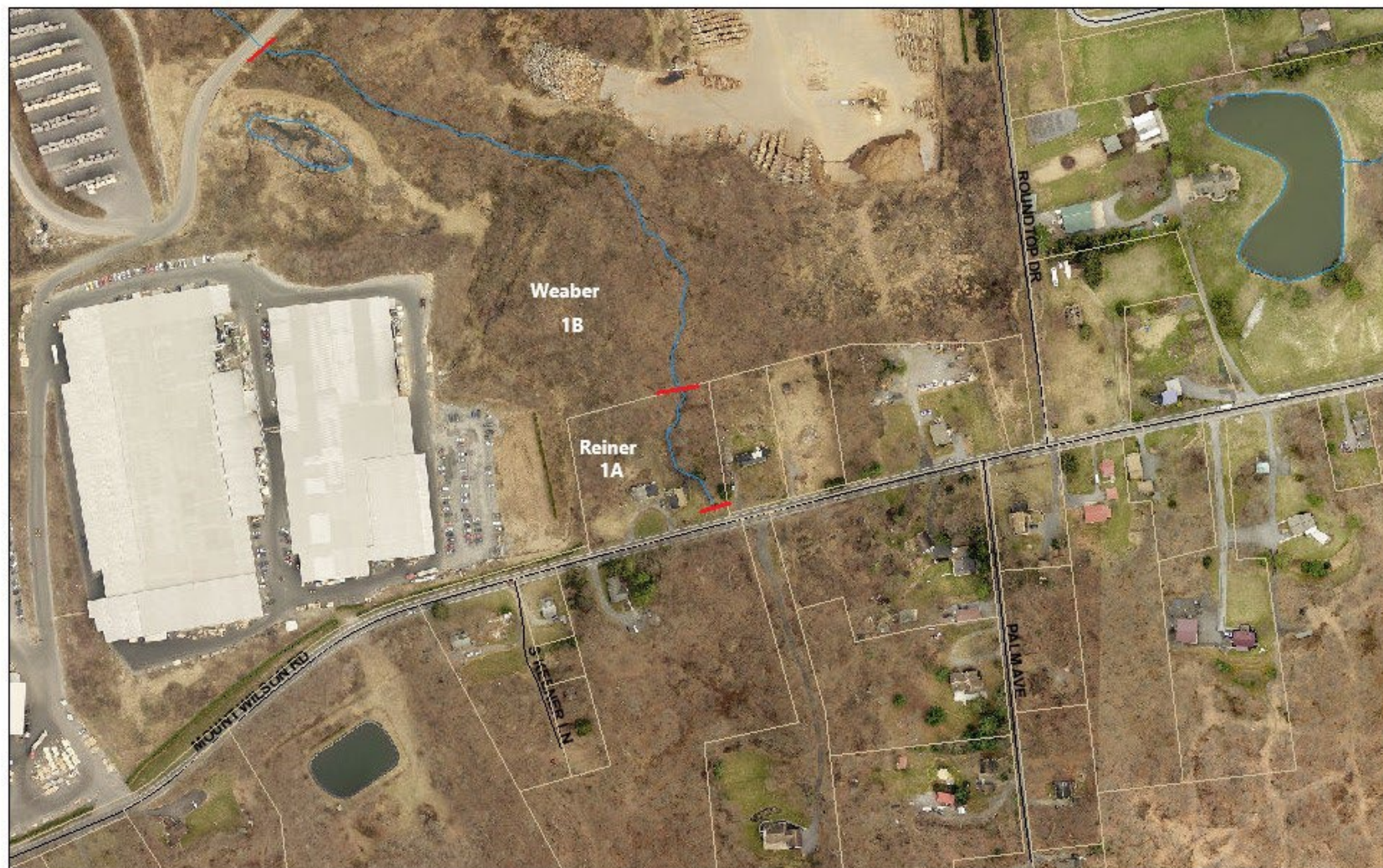
Figure 1 – Area of Upper Gingrich Run included in 2023 Field Reconnaissance Survey