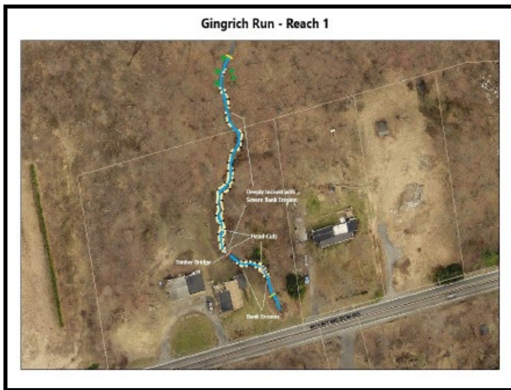
Figure 2 – Stability Problems Identified

The existing conditions are documented in Figure 2 and Photos 1 – 11.