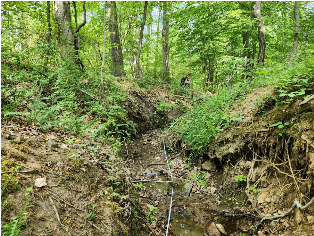
Photo 8 - Deeply incised channel with undercut and eroding banks