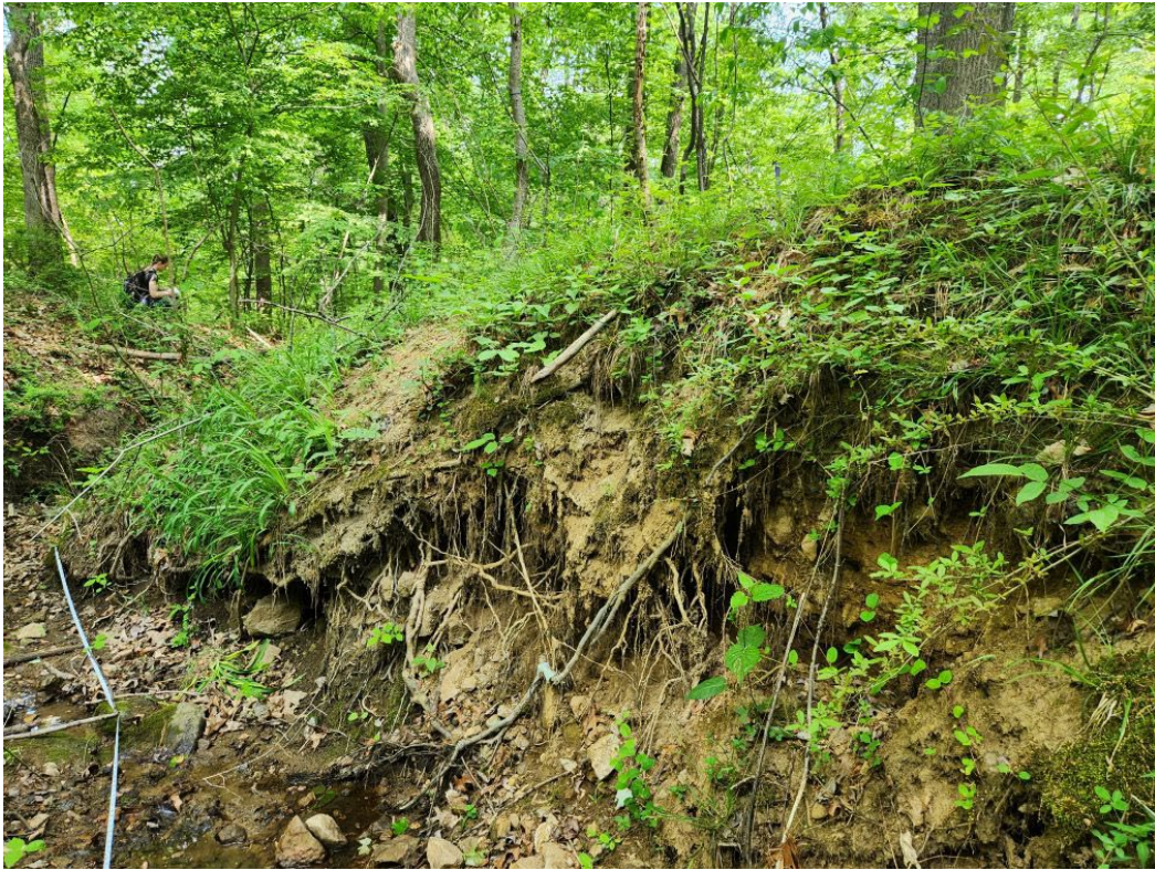
Photo 7 - Deeply incised channel with undercut and eroding banks