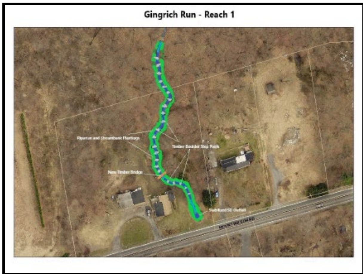
Figure 3 – Proposed Conditions

A Concept for the Stabilization Approach is shown in Figure 3. as well as Photos 12 and 13 showing completed projects that illustrate these approach.